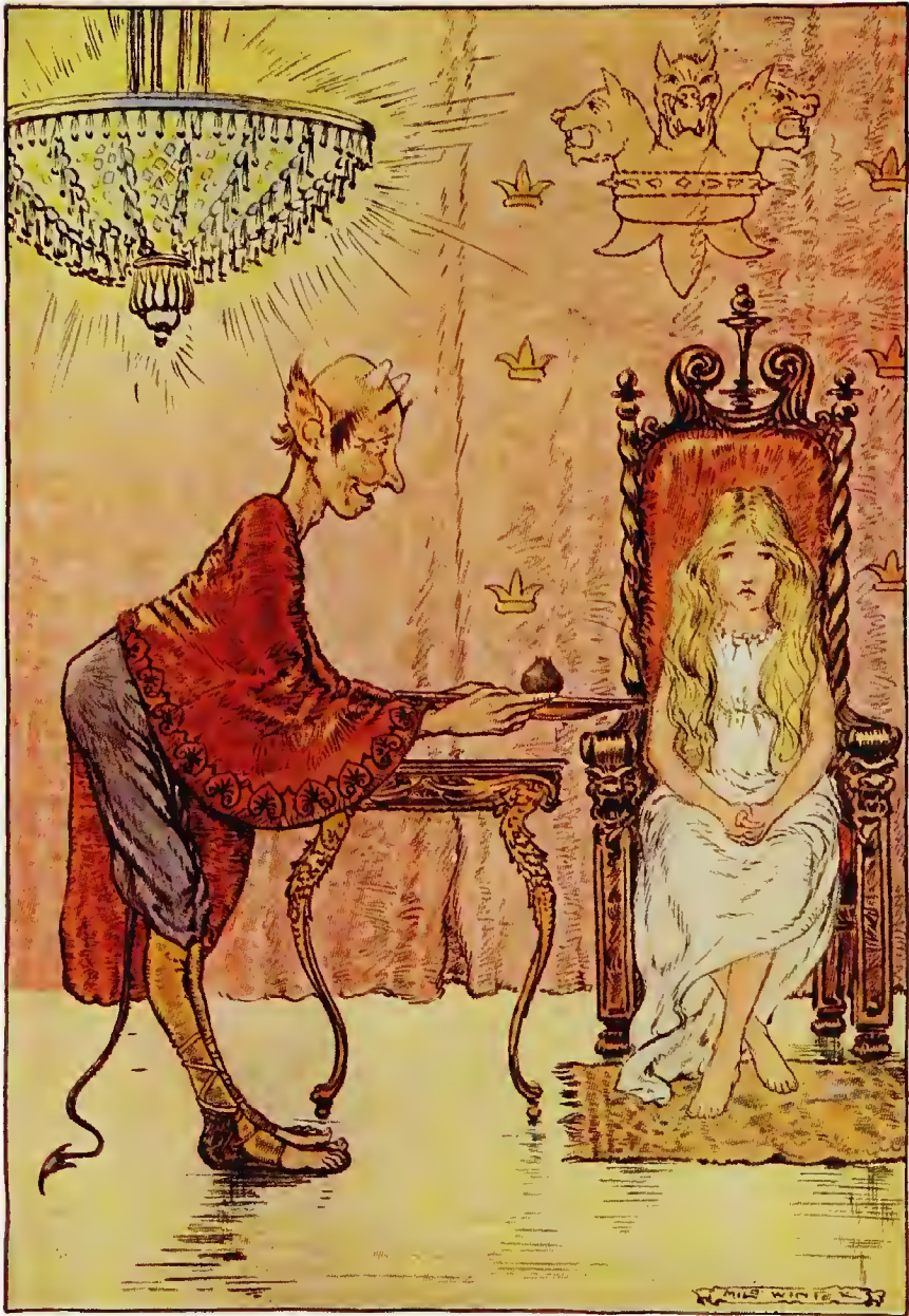
"It is the only one in the world," said the servant